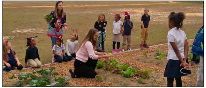
East Hill Edible Gardens works with C. A. Weis students.