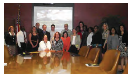
M.P.A. Capstone students at City Hall