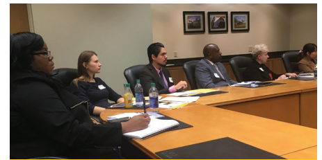
Students, faculty and practitioners participate in the panel presentation "Anti-Poverty Networks and Partnerships."