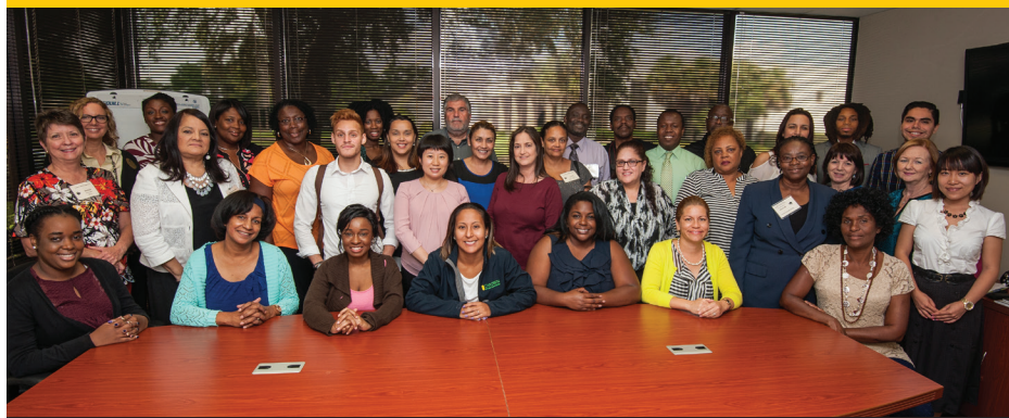
Nonprofit managers, UCF faculty and graduate students celebrate the successful conclusion of eight weeks of training and technical assistance.

Orlando-based Hope Central Inc. recently received a $40,000 grant after participating in the CPNM's 2016 capacity building seminar. The nonprofit organization, which is dedicated to decreasing the homeless and incarcerated population in Central Florida, received the funding from the Orange County Citizens' Commission for Children.