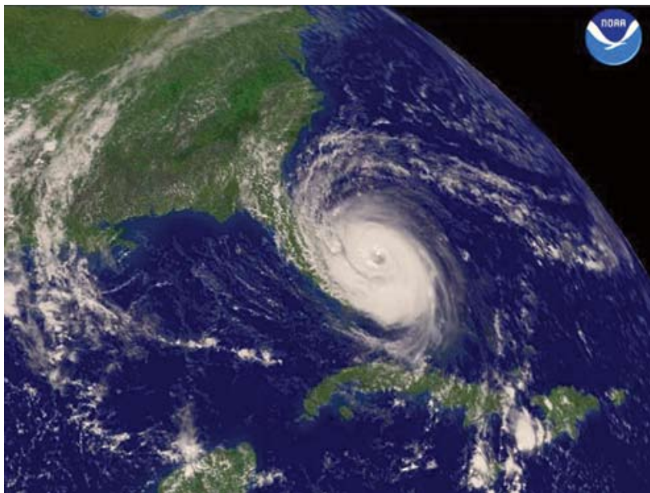
Hurricane Jeanne approaching Florida on Sept. 25, 2004.

"During hurricanes, we often see a lack of