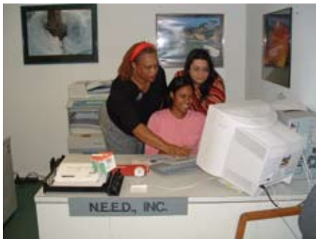
Nehemiah Educational and Economic Development, known as N.E.E.D., was one of eight nonprofits to benefit from UCF's assistance. N.E.E.D. works with individuals who have been impacted by the AIDS epidemic.