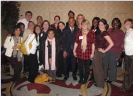
Participants at the American Humanics Management Institute

national American Humanics Program Excellence Award, which recognizes high-quality programming and outstanding professionalism demonstrated by AH students. AHSA created a video about AH at UCF (see http://tiny.cc/z2j43 ), which it presented at the American Humanics Management Institute, held in Indianapolis, Ind., in January 2010. At the institute, eight UCF students were awarded prestigious NextGen Scholarships worth $4,500 each.