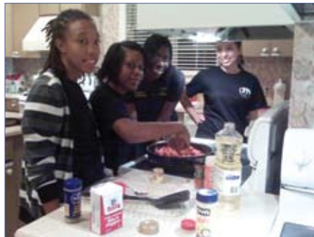
(Top) OPA volunteers outside the Ronald McDonald House and (bottom) in the kitchen, preparing a spaghetti dinner for visiting families