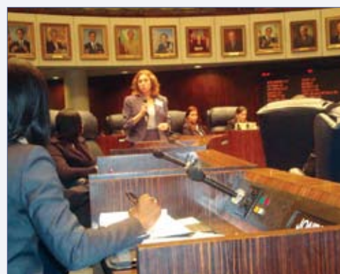
Mock debate at the Senate