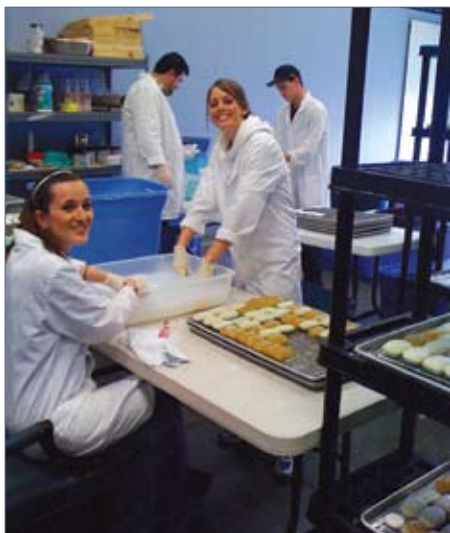
MPASA volunteers helping to sanitize hand soap for earthquake victims in Haiti