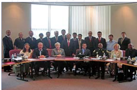
Public Service Leadership Development Program graduates and faculty members