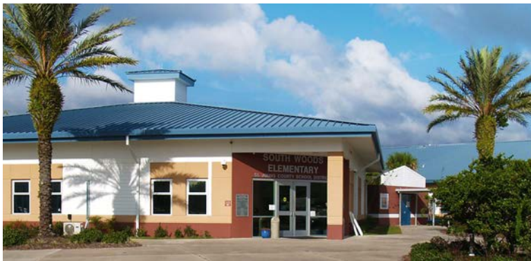
South Woods Elementary