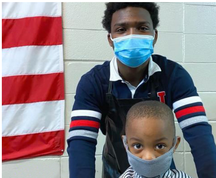
Sabal Palm student receives haircut from Lively Technical College.

Lively Technical College (LTC) Barber School visits Sabal Palm Elementary (Leon) twice a month. The benefit is two-fold: practical experience for LTC's students as they prepare for the Florida Barber License Examination, and free haircuts for Sabal Palm students and staff. In one month, 79 haircuts were provided at an average cost of $15/haircut, totaling $1,185 in services.