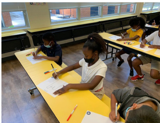
Franklin Park students draw new school concepts.

Franklin Park Elementary , (Lee) the county's first Community Partnership School, is embarking on a nearly full-campus rebuild, including the addition of an almost 10,000-square-foot community center with food, clothing, medical, mental health, financial and employment services. The new campus in Ft. Myers' Dunbar community is expected to open in August 2024. The rebuild is currently in the planning stages and the school hosted forums for stakeholders to offer input - several students even participated in building design ideas. bit.ly/3i8NjRI , bit.ly/3hG3OWe