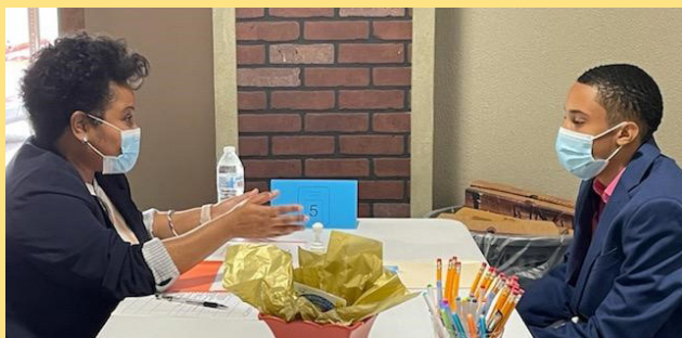
Orange Park student participates in mock interview.

► Orange Park High School (Clay) hosted its first Suit-Up Saturday event in April. Volunteers conducted a series of job interview workshops including Dress for Success, Writing the Resume and Professionalism 101, as well as mock interviews and feedback. Participants enjoyed lunch courtesy of Orange Park Mall.