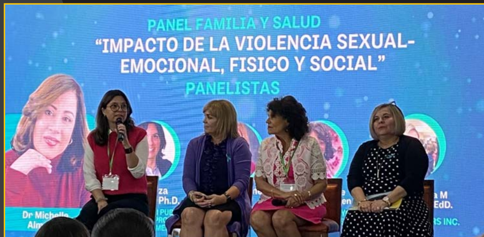
Domestic Violence Impact in the Hispanic Community