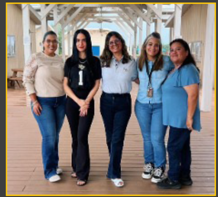
East Coast Migrant Head Start Project HUD Renters Study