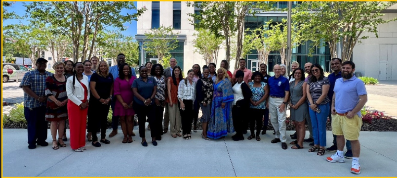
Orange County Financial Management Training 2024