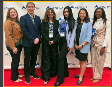
Arnova Conference 2023