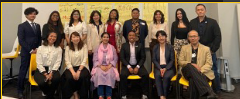
International Visitor Leadership Program (IVLP) 2024