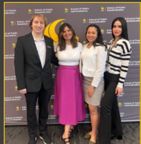
CPNM Staff Orange County Capacity Building Closing Ceremony 2024