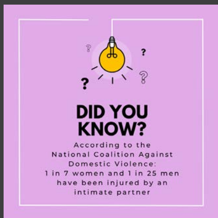
Enterate: You Have Choices Social Media Campaign Post