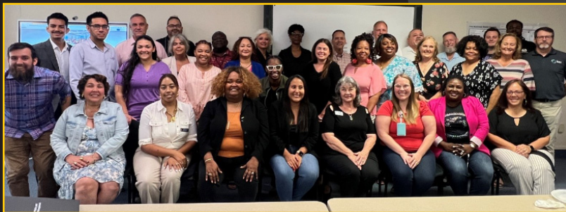
Osceola County Capacity Building Seminar 2024