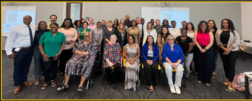
Orange County General Capacity Building Seminar 2024