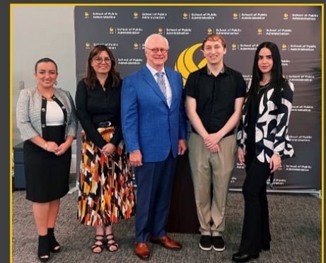
Public Administration Research Conference 2024